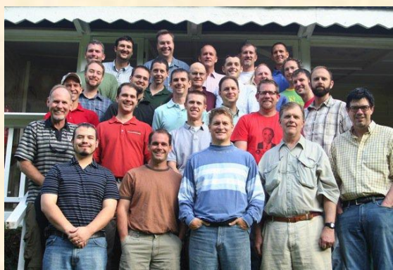
East Africa Missionary Men